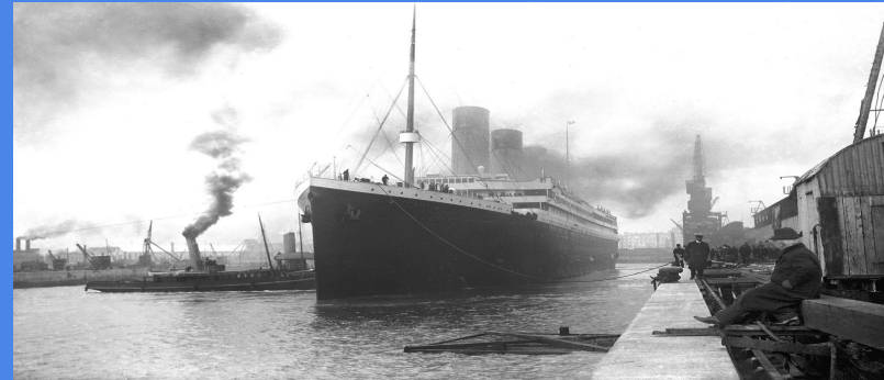
The Titanic ship in Southampton harbor

The Titanic was built in 1911 the ship was fitted with all the latest safety equipment, so at the time people thought the ship was unsinkable. The ship was built by Harland and Wolff who employed over 15,000 men to work on the Titanic. It took 2 years and 2 months to complete then finally it was time to set sail. The Titanic set sail for New York from Southampton on April 10, 1912, but sadly it never reached its destination.