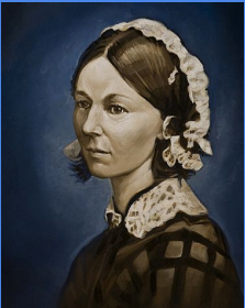
A painting of Florence

When Florence began nursing, others considered nursing unimportant and of low status. The current nurses were untrained and not taught the basic methods about tending the ill and wounded. Hospitals were considered a place to die, due to the hospitals being so unclean people would often catch diseases and die. Florence helped the death rate in hospitals drop from 44% to 2% ,this was due to her making the hospitals cleaner and safer. This inspired others to make other hospitals cleaner and safer leading to the modern nursing we have today.