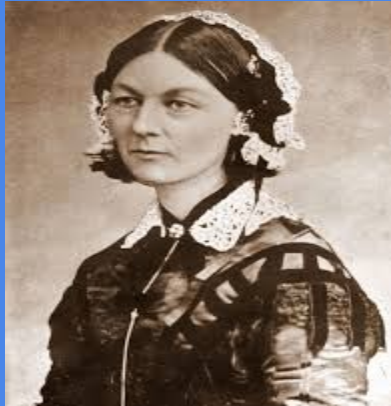
Florence in an early age.

Florence Nightingale was born in 1820 in Florence, Italy. From a young age Florence was working in philanthropy tending to the ill and poor people in her local village. In the early 1850s Florence returned to London to become a nurse where she helped to make hospitals cleaner, safer and more comfy for patients and visitors in the hospitals.