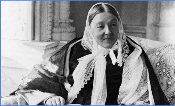
Florence in the later stage of life.

In Turkey during the Crimean war, Florence earned the name The Lady With The Lamp. She began being called this, because she would visit every single patient in the Scutari hospital, carrying a lamp. She would make sure that they were comfortable and managing their pain.