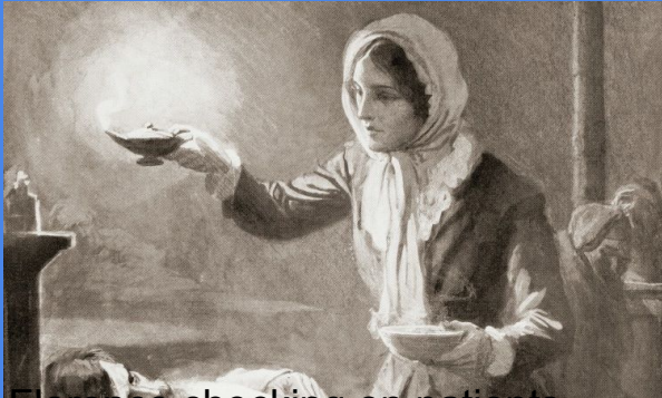
Florence checking on patients

Florence's passion was helping others in need. She was an educated woman, whose early work in nursing was unpaid. At 17 years old Florence said she felt that God spoke to her, calling her for future "service". From that point in time Florence's life changed forever. This led to all of the accomplishments she has completed over the past years.