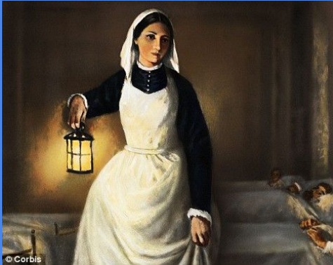
Florence holding her lamp.

Florence Nightingale mainly became famous because of her work during the Crimean war. On November 4th, 1854, 38 nurses arrived in Turkey. With Florence's leadership, her and the nurses brought cleanliness sanitation nutritious food and comfort to all of the patients. She returned home in 1857 as a heroine this was due to how many lives her and her nurses saved.