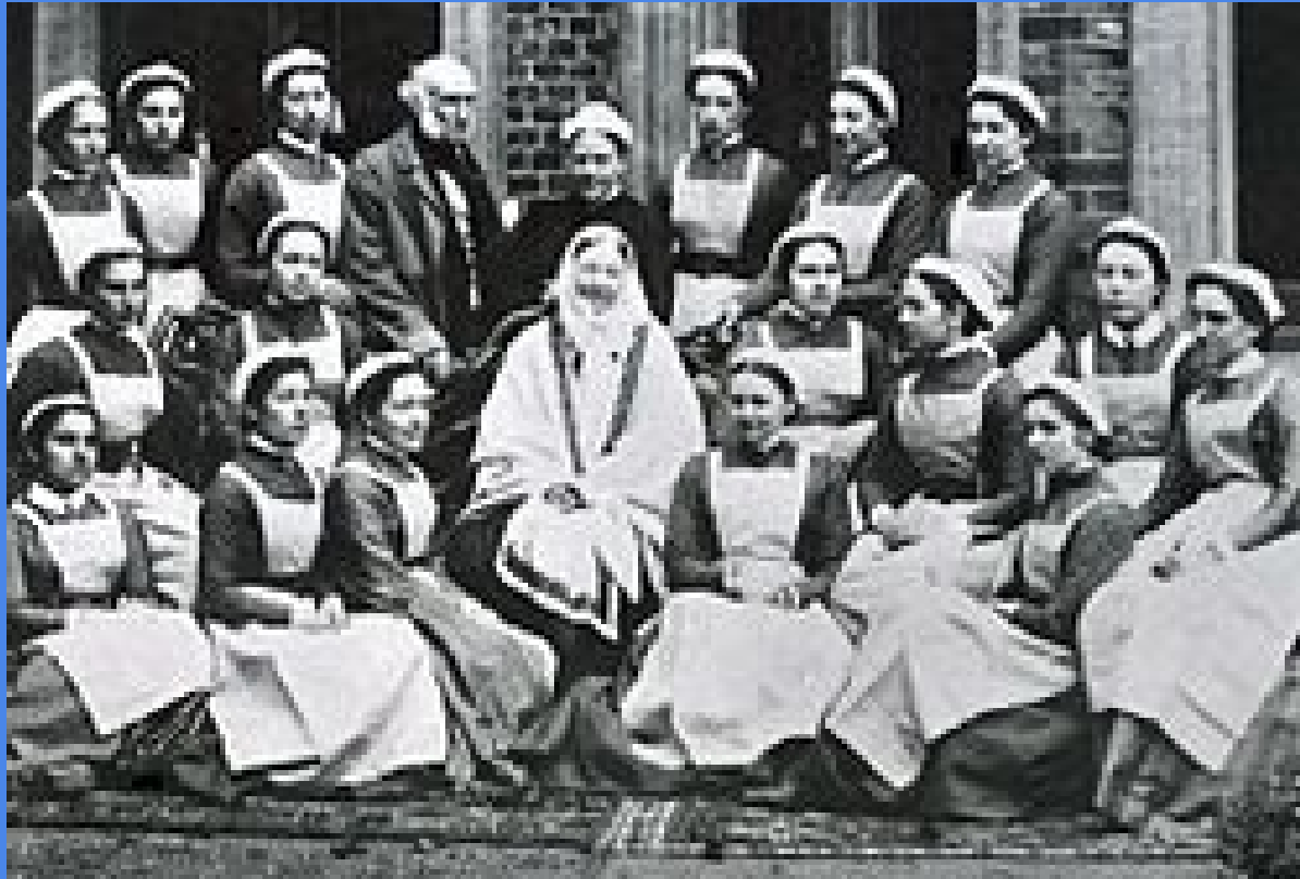
Florence and her nurses in the Crimean War