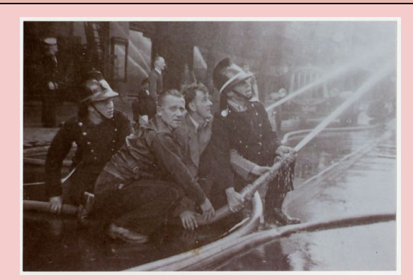
Firemen trying to put out the flames in the 'Ballantynes' store.

One of the two main theories is that the fire was caused by a cigarette being carelessly dropped onto the ground in the basement. The cigarette was not put out properly which then caused flames. The building was made out of timber also helped the fire spread between the three floors. Another theory is that it was just an electrical fault. They found no conclusive evidence to support either theory.