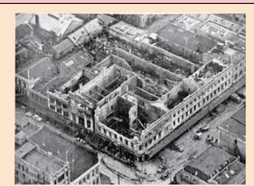
The ruined store a few days after the fire was put it out

A lot of miscommunication happened on that day. No one went to warn the workers on the top floor, who had just come back from their lunch break, about the fire. By the time they found out, it was too late. The unlucky people who were on the 2nd and 3rd floor were stuck, and had no way of getting out. Most of the workers were overcome with smoke, which affected their health long term.