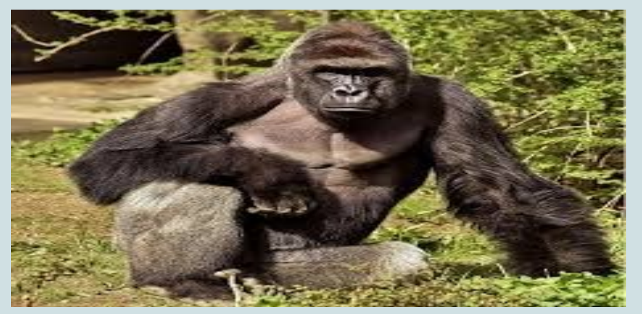
Silverback Gorilla (Alpha male Mountain Gorilla).

Mountain Gorillas are the dominant gorilla species. Being the biggest primates around (and the inspiration of king kong) they are also rare for many reasons. They live in mountain areas in Africa, for example: Uganda. Mountain gorillas spend a lot of time on the ground rather than swinging in the trees. Alpha male Mountain Gorillas are called "Silverbacks". Silverbacks are usually the only adult male in a pack of Mountain Gorillas. They are called silverbacks because their hair darkens and they develop a large amount of grey fur on their back. They schedule feeding trips and resting to protect their pack.