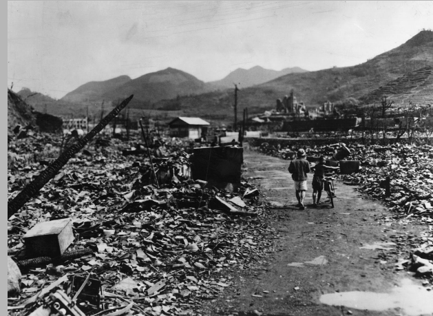
Survivors walking a lonely road.

On 6 August 1945, a terrible event took place in Japan, Nagasaki. 3 days before the first bomb had been dropped by the American army in Hiroshima. This one was dropped on Nagasaki and ordered by Truman. It was meant for Kyoto in Japan but was too cloudy. So they flew over and dropped the bomb on Nagasaki but this was also cloudy so they missed the drop point. It hit the valley but still killed a majority of people and caused a massive amount of damage. The bomb was called the Fat Man because the bomb was slightly bigger than the Little Boy, the first bomb and the plane was called Bockscar.