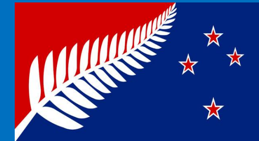
One of the many flag designs that the flag consideration panel will have to decide on.

I think that New Zealand's flag should stay the same because the money could be spent in higher priority areas and because there is so much history that comes with our current flag. Firstly, it's going to cost $26 million. We could spend the money on more important things, like helping the homeless, fixing state houses or in the health or education areas. Also, our soldiers fought and died under that flag and it has stood proudly when our athletes won medals at sporting events.