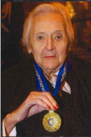
In her old age with her Companion of the Order of Australia from WWII.