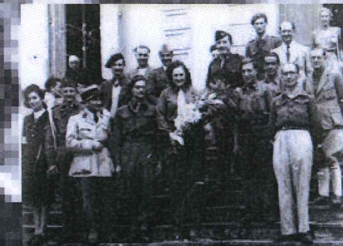
Nancy Wake being given flowers when she returned home after the war as everyone said she was a hero.

Nancy Wake led in WWII. She led the French Resistance in the war which started in 1939. Nancy was one of the most decorated women in the war so she really was courageous, brave and fought hard for Britain when they needed her.