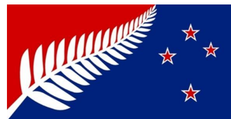
One of the many flag designs entered.

In this year's first referendum firstly the panel ask New Zealanders what they stand for and what they want on the flag. New Zealanders then have an opportunity to put flag designs in. The panel then pick 4 designs they think best and New Zealand rank the 4. The one that ranks number 1 gets put up with the original in next year's referendum and New Zealand vote which one. The one with the highest vote will be the New Zealand flag.