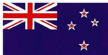
Original NZ flag adopted in 1902.

Arguments for a change in our national flag: Some people think the flag should be changed because they think it is 'old fashioned' in some ways such as the Union Jack. They think it has been around too long and that New Zealand should have a change. Another reason is people say it is far too similar to the Australian flag because they have the Union Jack, Blue ensign and Southern Cross. But if you look closely we have different coloured stars and Australia's has more stars.