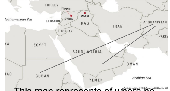
This map represents of where he travelled to. Saudi to Afghanistan and Afghanistan to Sudan.