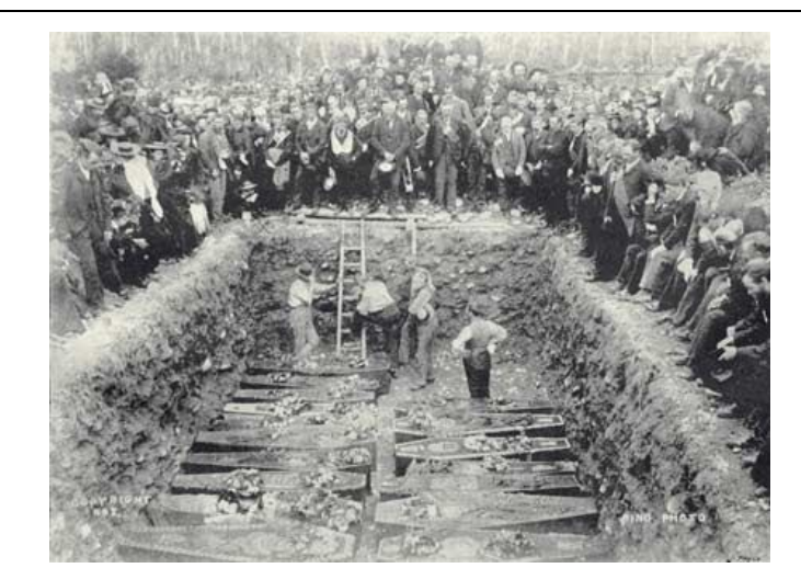
These are the graves of 33 men that were too distorted to recognise after the explosion.