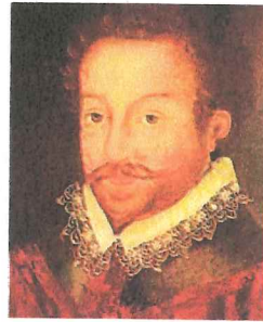
Picture of Sir Francis Drake