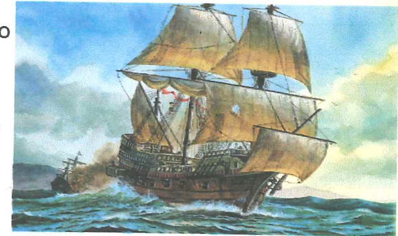
Picture of the Golden Hind Ship

Sir Francis Drake's ship was called the Golden Hind ship which was the first ship to circumnavigate the world. The ship of Sir Francis Drake had five decks and three masts. It was the only vessel to return from Francis Drake's expedition out of five vessels that had originally set out from England.