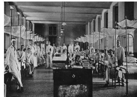
British, Australian and New Zealand wounded being treated at Bighi Naval hospital, Malta.