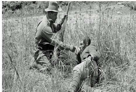
An ANZAC soldier saw giving water to a wounded Turkish soldier during the battle of Gallipoli.