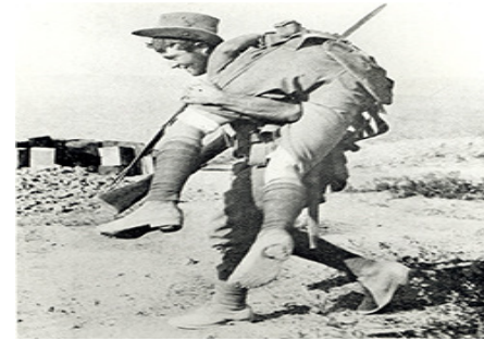
An Australian soldier carries his wounded mate in Gallipoli, 1915.