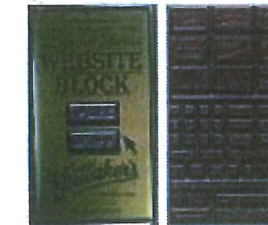
Whittakers chocolate website block, an exact replica of their website (the first chocolate website)